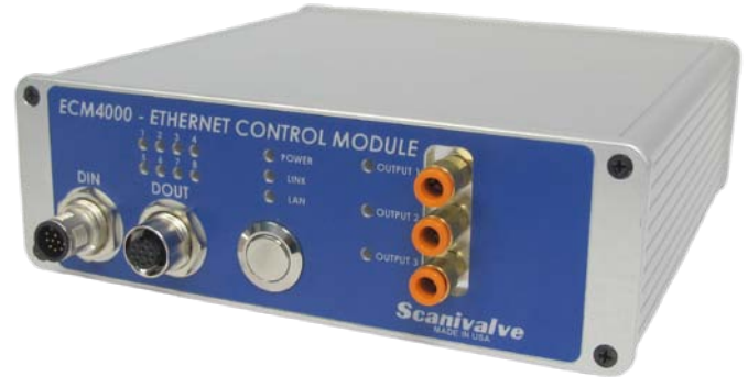
ECM4000 - Ethernet Control Module