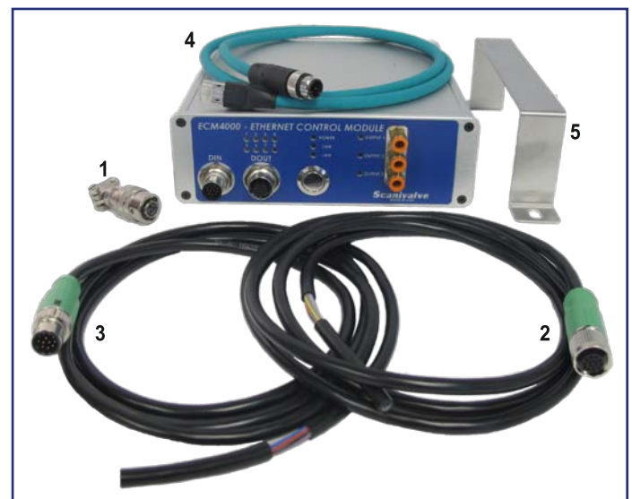
ECM4000 & Supplied Accessories*

The ECM4000 is provided with most accessories required for operation: a mating connector is provided for the power connector (1), 1m long cables with flying leads are provided for the digital input (2) and digital output (3) connectors, a 1m long Ethernet cable (4) is provided for communication, and a stainless steel mounting strap (5) is provided to secure the ECM4000. Power requirements are wide (9-36Vdc) so most DC power sources will work to power the ECM4000.