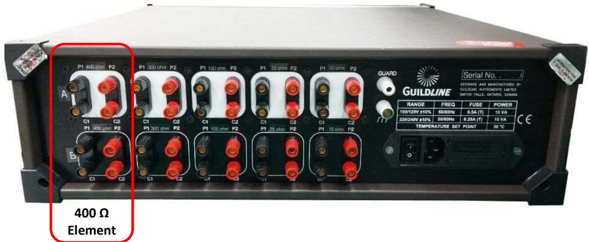
Model 7334-TC with 10 Custom Elements in a Temperature Controlled (TC) Enclosure

Note that these sets shown, when calibrated by an independent National Measurement Institute (NMI) , were reported as "Element Value" White and "Element Value" Black. The results are very impressive as per the following Calibration Report.