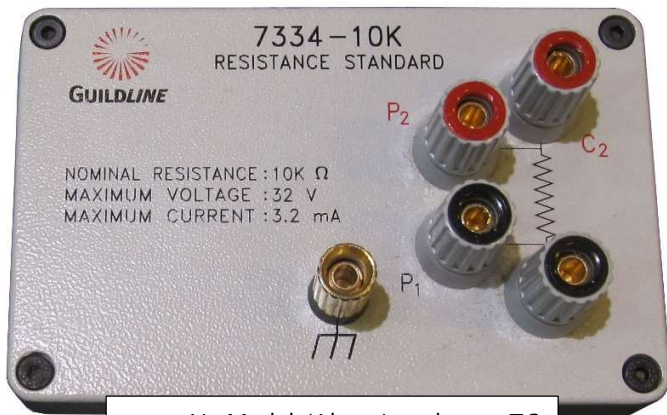
7334 Air Model (Above) and 7334-TC (Temperature Compensated) (Below)

Very High Stability Calibration Laboratory AC/DC Resistance Standards