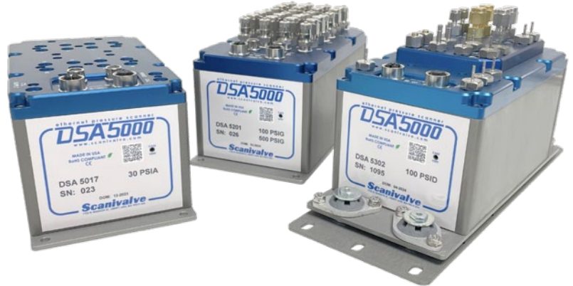
From Left to Right: DSA5000 - Standard Gas, DSA5200 - All-Media, DSA5300 - Gas / iDDS with "QD" Header and Shock-Mount