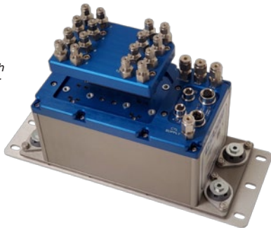
DSA5000 Gas shown with optional “QD” Px Header and Shock Mount Kit

All-Media or liquid builds are designed to handle a wide variety of compatible measurement media including water, oil, fuel, vapor, and more. All-media builds will have unique features including: