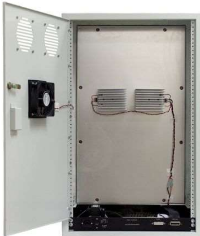
5030 Series Rear Access

These Air Baths have also been designed for ease of field maintenance through the use of modular components and sub-assemblies.